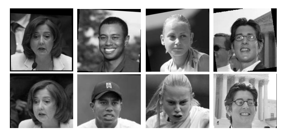
Fig. 2. Example positive image pairs from the LFW [27, 35] dataset.

w.r.t. a single training pair (\mathbf{x}_i, \mathbf{x}_j, y_{ij}) , are given by