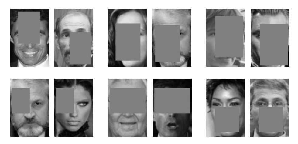
Fig. 3. Examples images showing the kind of occlusions used in the experiments. The top row shows random occlusions while the bottom row shows focussed, and fixed, occlusion of eyes (one, both) and mouth+nose.

face around the nose and the mouth. We then occlude these regions, one at a time and in combinations, by overlaying uniform patches. As with the random occlusions above, we do it for one of the, randomly selected, faces in the pair. We test the system for robustness to occlusion of (i) left/right eye, (ii) both eyes, (iii) central face part around the nose, (iv) mouth and (v) nose and mouth. Fig. 3 (bottom row) shows examples of such occlusions.