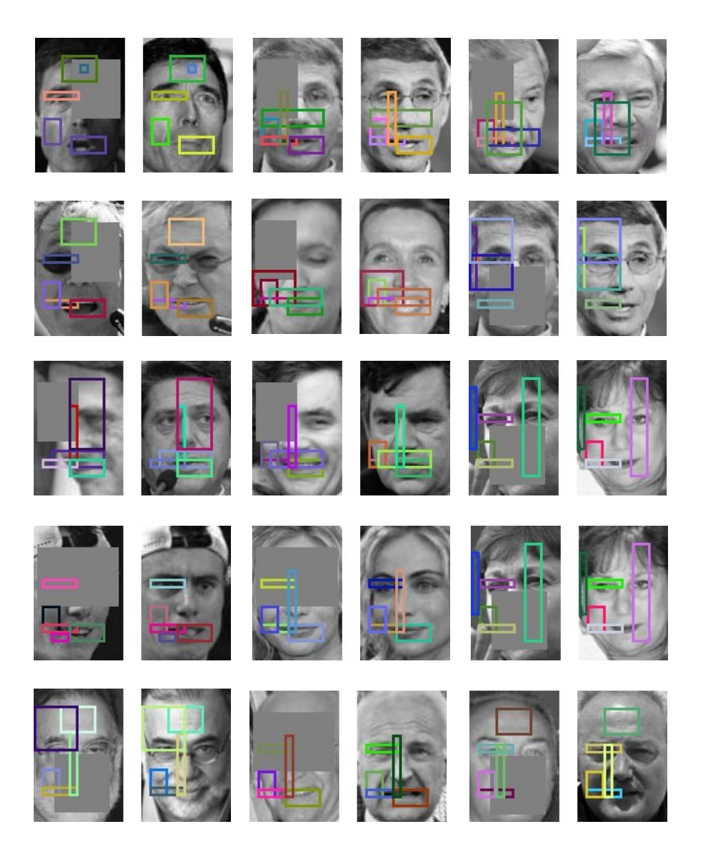
Fig. 5. Visualization of the parts used by the proposed EPML model, for matching pairs of faces in the presence of significant occlusions. The top 5 parts out of 20 (with randomly selected colors for better visibility) selected by the model for scoring the face image pairs are shown. We observe that the method quite successfully ignores the occluded parts. The parts used are also quite diverse and have good coverage as ensured by the model. See §3.2 for discussion.